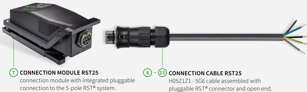
7 CONNECTION MODULE RST25 connection module with integrated pluggable connection to the 5-pole RST® system.

For pluggable outlets to the charging stations, replace positions 4, 5 and 6 with position 7 and one of the positions from 8 – 13.